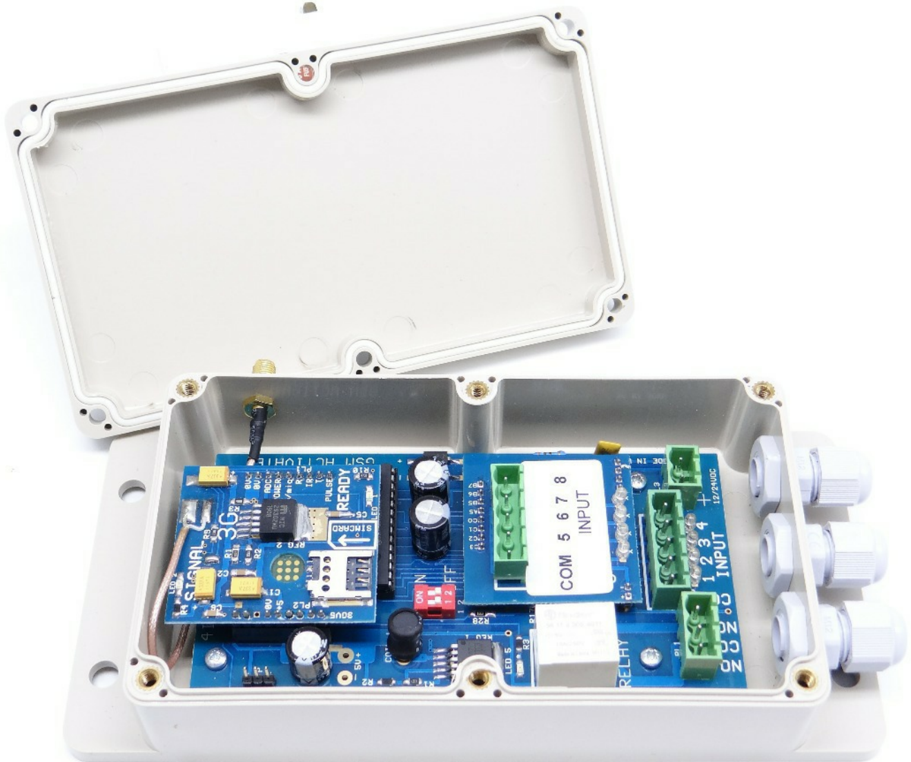
Model number 2G/3G ad4in1V4 - 8 Inputs